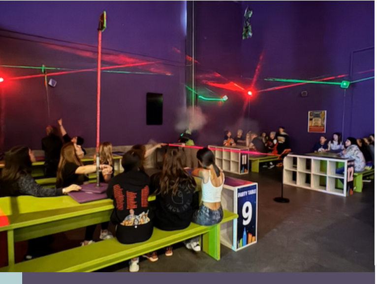
Grade 8s fieldtrip to Laser City for Science