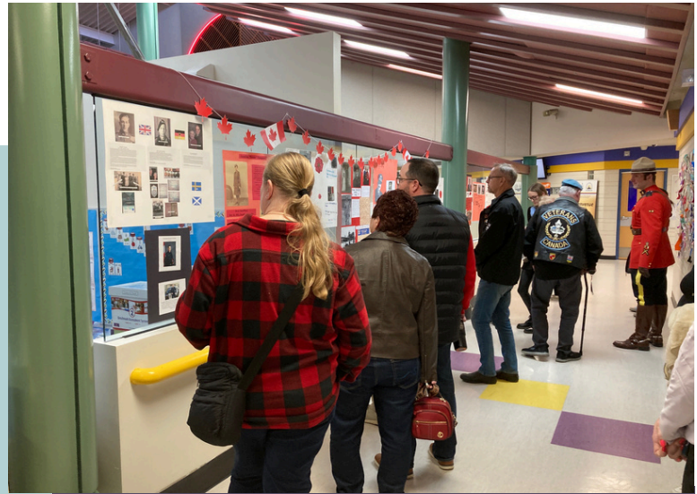
Guests viewing our beautiful Veteran's Gallery Walk